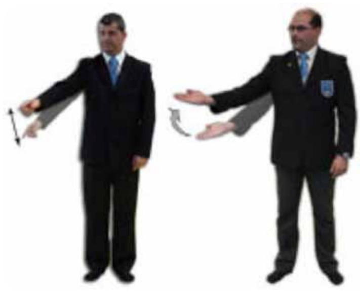
Penalty for refusing kumikata pulling label